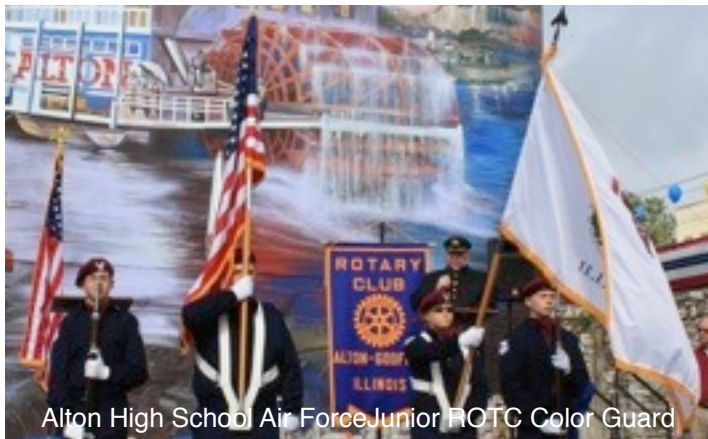
Alton High School Air Force Junior ROTC Color Guard